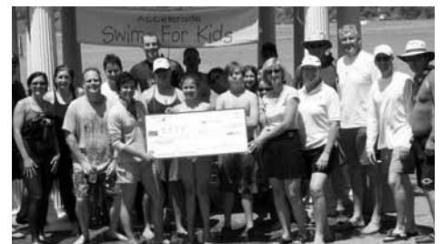
SWIMMERS AND KAYAKERS MET FOR A PARTY AFTER THE RACE.