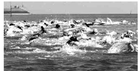
SWIMMERS INCLUDING PETRA START THE RACE.